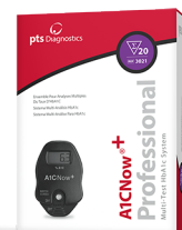
A1CNow + system 20-count test kit REF 3021