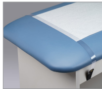
040– Paper Cutter