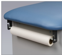
030– Paper Dispenser