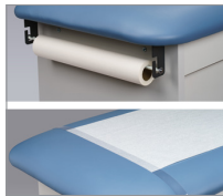
034– Paper Dispenser & Cutter Combo