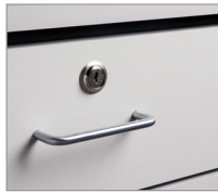
055– Door & Drawer Locks