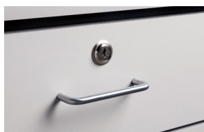
055 Drawer Locks