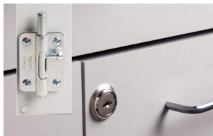
066 Door Locks & Latch Combo