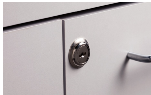
055 Door Lock