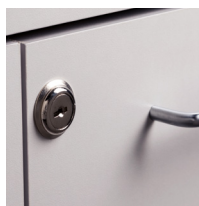
055 Door Locks