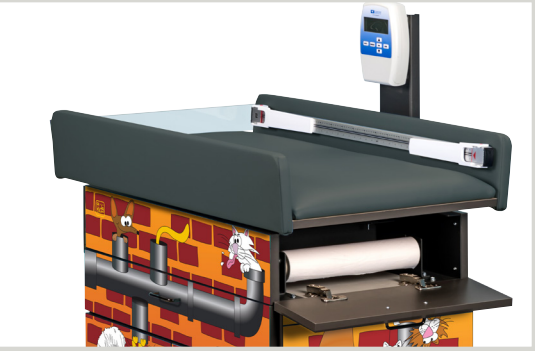
Paper Dispenser Choose to access concealed paper dispenser from either end

Infantometer Built-in infantometer with folding ends for measuring height