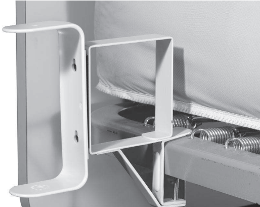
1. Attach mounting bracket to bed

The unit comes with two self adhesive Velcro® strips. Apply one strip to the OUTSIDE of the metal mounting bracket, as shown. Attach the other strip to the OUTSIDE of the adjustable bracket that fits around the unit.