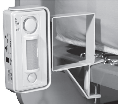
2. Attach unit to mounting bracket