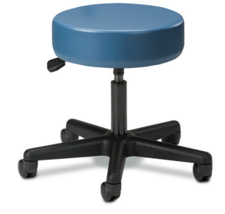
Prop 65 Warning

WARNING: This product can expose you to chemicals, including diisononyl phthalate (DINP), which is known to the State of California to cause cancer. For more information go to www.P65Warnings.ca.gov.