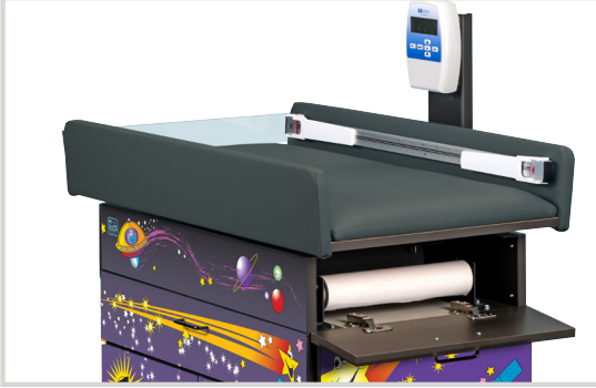
Paper Dispenser Choose to access concealed paper dispenser from either end

Infantometer Built-in infantometer with folding ends for measuring height