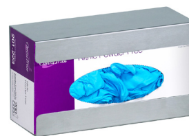
Shown in the horizontal position

*Clinton stainless steel items are not M.R.I. compatible.